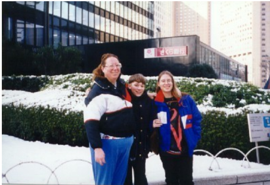
This photo shows the family in Tokyo Japan. This was our first day together. Tokyo had a rare snow fall that morning leaving everything a beautiful White. Look at those smiles! We all had a great Time!